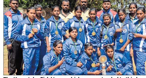
The Karnataka Girls' team which was contended to third